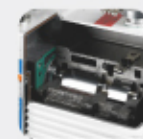
Integrated pump body structure