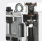
Auto anti-suckback valve